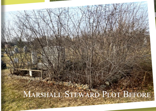
MARSHALL STEWARD PLOT BEFORE

FUNDS RAISED IN 2020 Kroger Rewards $724.33 Calendar Sales $675 Donations $310 Fire Dept. Bottle Drive $54.40 Amazon Smiles $41.81