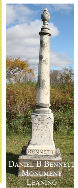
DANIEL B BENNETT MONUMENT LEANING