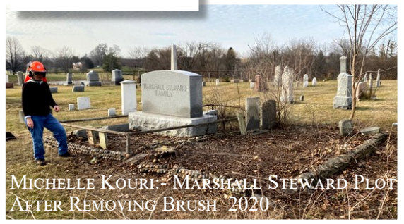
MICHELLE KOURI - MARSHALL STEWARD PLOT AFTER REMOVING BRUSH 2020