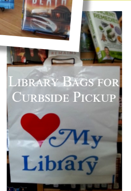
LIBRARY BAGS FOR CURBSIDE PICKUP