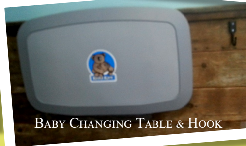
BABY CHANGING TABLE & HOOK